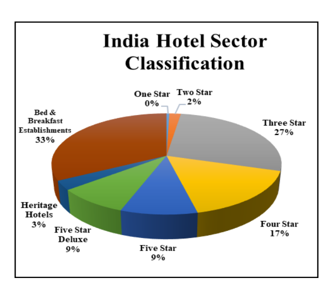
Figure 3: Classification of Indian Hotel

Organized Hotels: India has a vast hotel sector, but only a small percentage are considered four stars or above. The overwhelming majority of hotels are small, traditional outlets that provide inexpensive accommodations and locally source all their food. In 2022, India has classified 1,377 hotels in the star category and out of these majority were three-star hotels followed by four-star hotels. Also, there are approximately 324, five-star hotels across India as of 2023. As per the report, the number of branded hotel rooms in India stood at over 150 thousand in financial year 2022 and it is expected to add 59,238 rooms between 2022 and 2027. Some hotels obtain special licenses that enables duty free food and beverage purchases (and other items such as equipment and furniture), subject to their foreign exchange earnings.